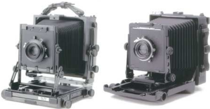
(Above left) The Shen Hao HZX45-IIA. A solid little brick of a camera that works as well as it looks. The cluster of knobs on the rear takes a little getting used to, but after a couple of days with the camera I grabbed the right one almost every time. (Above right) The Toyo 45CF. One derisive comment I read on the Internet was that the 45CF is plastic. Well, yeah it's supposed to be, but so is Lance Armstrong's time trial bike. That's what makes 'em both so light.