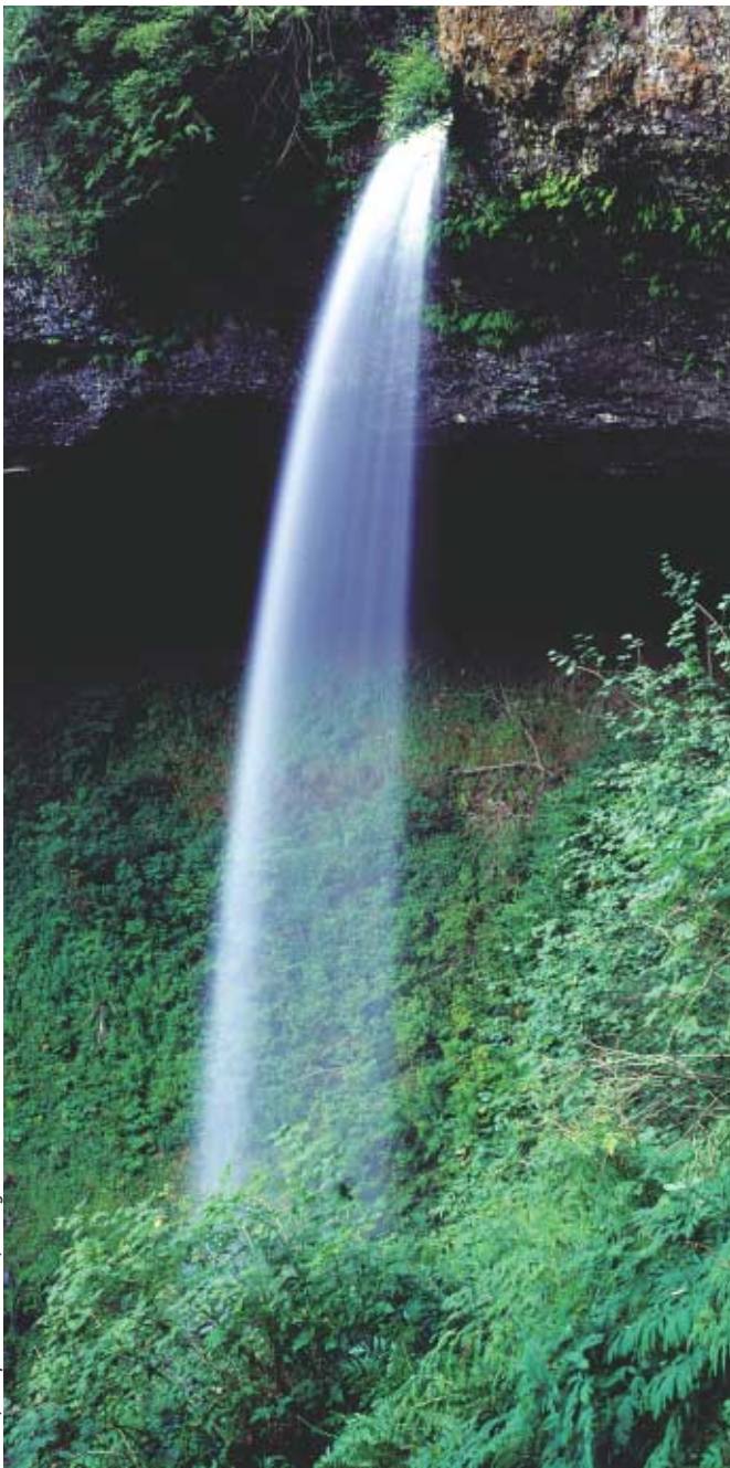
© 2003, Joseph A. Dickerson, All Rights Reserved