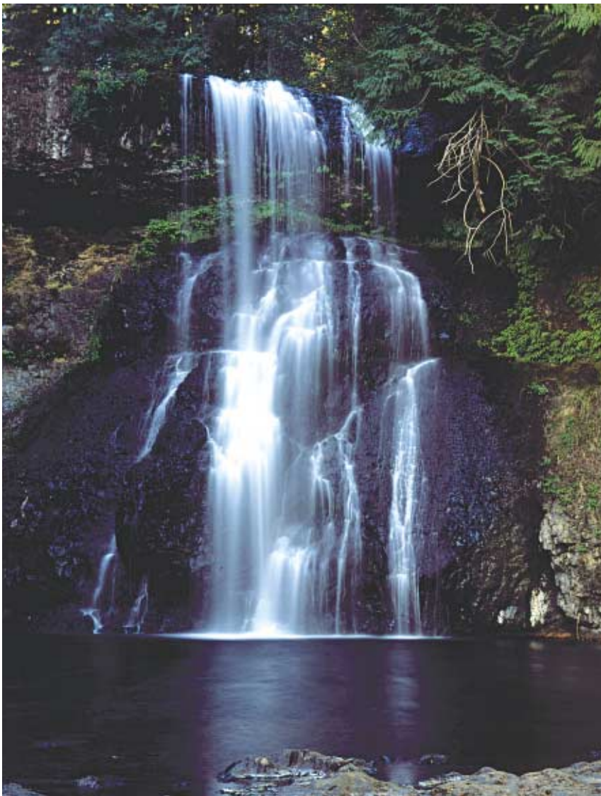
Upper North Falls, Silver Falls State Park, Oregon. The Shen Hao with a 210mm lens. The generous movements of the Shen Hao made shots like this easy to accomplish.

While large format photography probably can't match the excitement that digital photography generates there is a definite resurgence of interest. This renewed appeal is shared by amateur and professional photographers and seemingly encompasses the entire photographic spectrum, from commercial photography to fine art. Many, like myself, work with a hybrid system, shooting images on film and then scanning the negatives or transparencies and tweaking them in the digital darkroom. Still others prefer a more purist approach and do all their work in the wet lab. Some of the