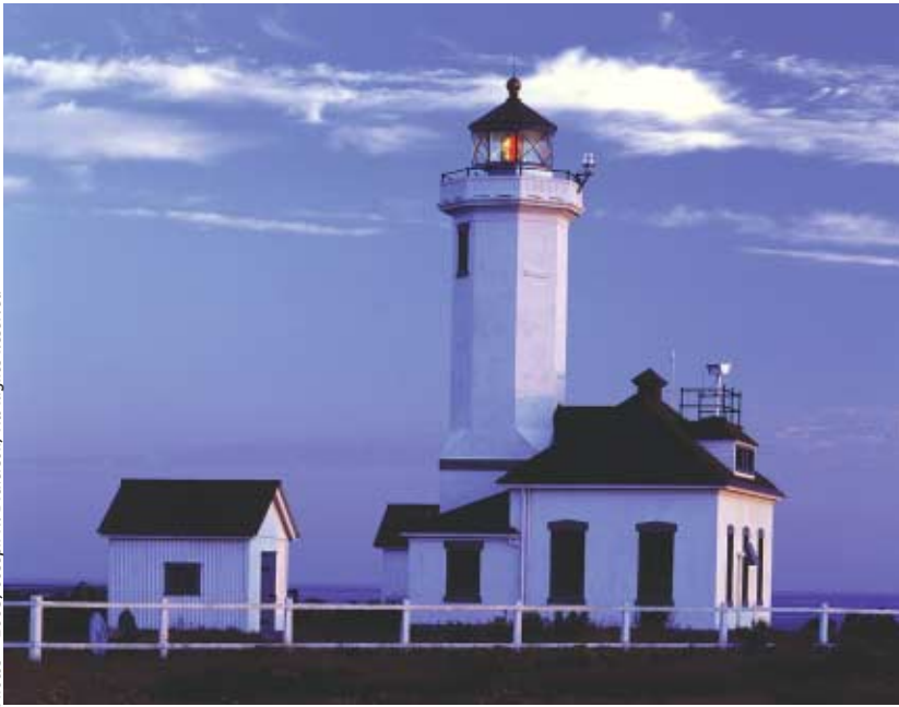
(Above) Point Wilson Lighthouse, Port Townsend, Washington. A cold and windy sunrise and I really appreciated the large knobs on the Shen Hao that were easily gripped even wearing polypro gloves.